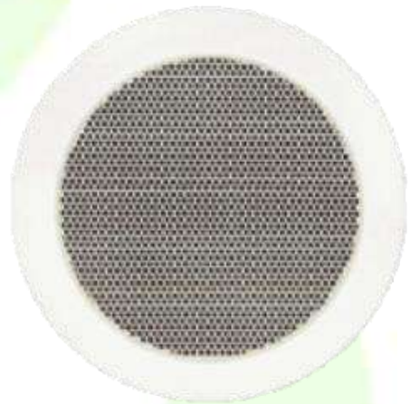
ROUND PERFORATED DIFFUSER