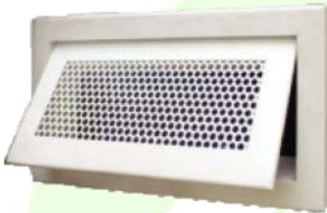
PERFORATED DIFFUSER (DOUBLE MARGIN)